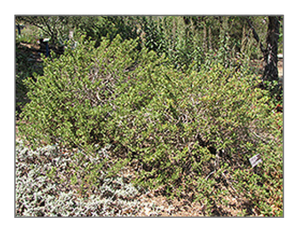
Terra Seca Sage