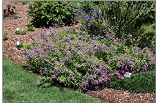
Little Bells Beard Tongue in bloom