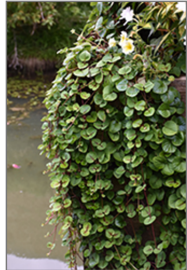
HILLIER Sunburst Moneywort