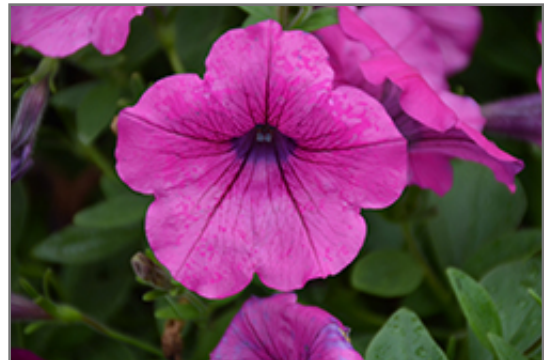
Opera Supreme Purple Petunia flowers

Opera Supreme Purple Petunia is recommended for the following landscape applications;