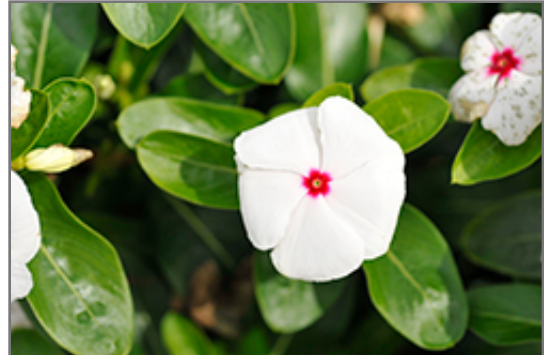
Pacifica XP Polka Dot Vinca flowers

Pacifica XP Polka Dot Vinca is recommended for the following landscape applications;