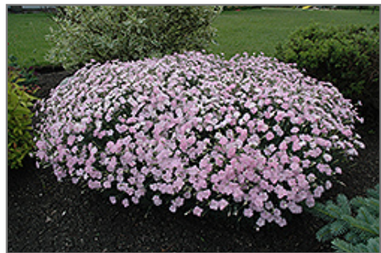
Mountain Mist Pinks in bloom