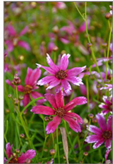
Satin & Lace Razzle Dazzle Tickseed flowers

Satin & Lace Razzle Dazzle Tickseed is recommended for the following landscape applications;