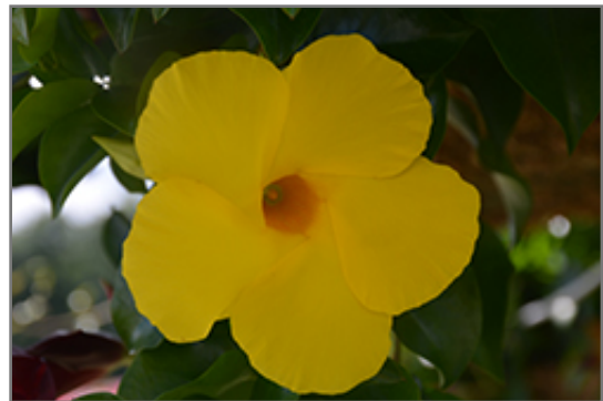
Diamantina Opal Yellow Mandevilla flowers