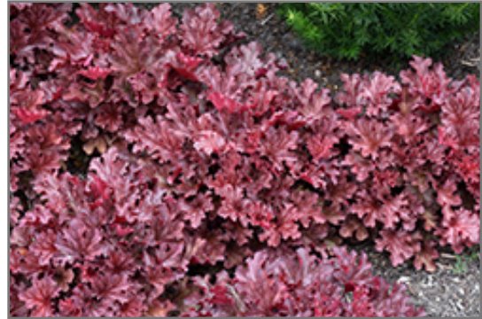
Ruby Tuesday Coral Bells

Ruby Tuesday Coral Bells is recommended for the following landscape applications;