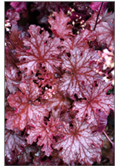
Ruby Tuesday Coral Bells foliage

Ruby Tuesday Coral Bells will grow to be about 9 inches tall at maturity extending to 16 inches tall with the flowers, with a spread of 14 inches. When grown in masses or used as a bedding plant, individual plants should be spaced approximately 12 inches apart. Its foliage tends to remain low and dense right to the ground. It grows at a medium rate, and under ideal conditions can be expected to live for approximately 10 years. As an evergreen perennial, this plant will typically keep its form and foliage year-round.