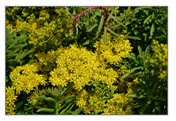
Middendorf Striatum Stonecrop flowers