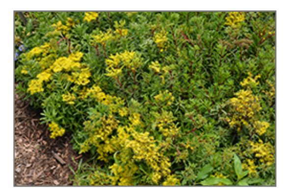
Middendorf Striatum Stonecrop in bloom