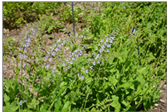
Ballet Sky Dance Sage in bloom