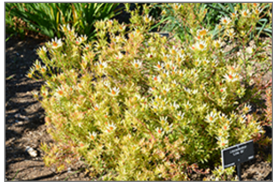
Little Bit Conebush

Little Bit Conebush makes a fine choice for the outdoor landscape, but it is also well-suited for use in outdoor pots and containers. With its upright habit of growth, it is best suited for use as a 'thriller' in the 'spiller-thriller-filler' container combination; plant it near the center of the pot, surrounded by smaller plants and those that spill over the edges. It is even sizeable enough that it can be grown alone in a suitable container. Note that when grown in a container, it may not perform exactly as indicated on the tag - this is to be expected. Also note that when growing plants in outdoor containers and baskets, they may require more frequent waterings than they would in the yard or garden.