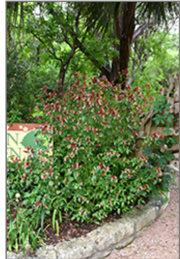
Fruit Cocktail Shrimp Plant in bloom