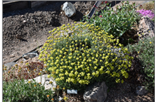
Kannah Creek Sulphur Flower Buckwheat in bloom

Kannah Creek Sulphur Flower Buckwheat is recommended for the following landscape applications;