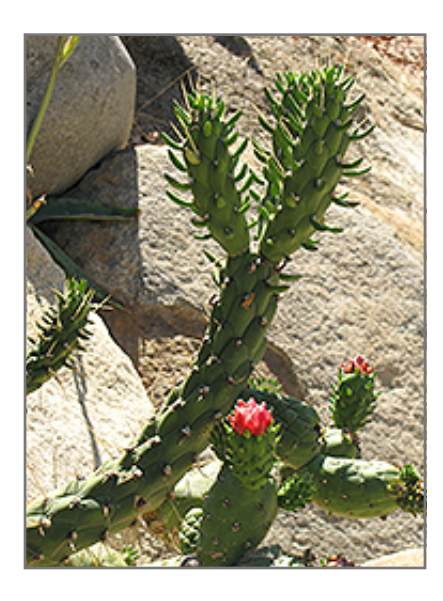
Eve's Needle Cactus foliage

Eve's Needle Cactus is a member of the cactus family, which are grown primarily for their characteristic shapes, their interesting features and textures, and their high tolerance for hot, dry growing environments. As an 'opuntiad' type of cactus, it doesn't actually have leaves, but rather modified succulent stems that comprise the bulk of the plant, and which are designed to retain water for long periods of time. This particular cactus is valued for its upright and spreading habit of growth on a plant consisting of long, narrow spiny dark green segmented stems that form 'branches' which spread out from a central base. This plant features showy scarlet cup-shaped flowers at the ends of the branches from mid spring to early summer. It features an abundance of magnificent red berries from late summer to mid fall.