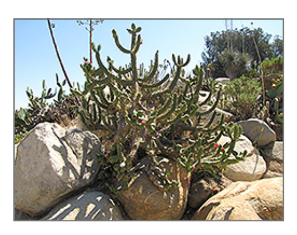
Eve's Needle Cactus