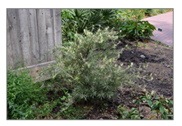
Okina Variegated Japanese Yew

Okina Variegated Japanese Yew is recommended for the following landscape applications;