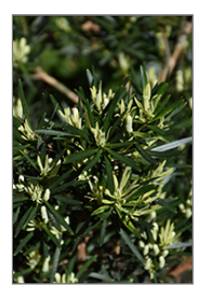
Okina Variegated Japanese Yew foliage