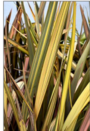
Misty Cream New Zealand Flax foliage