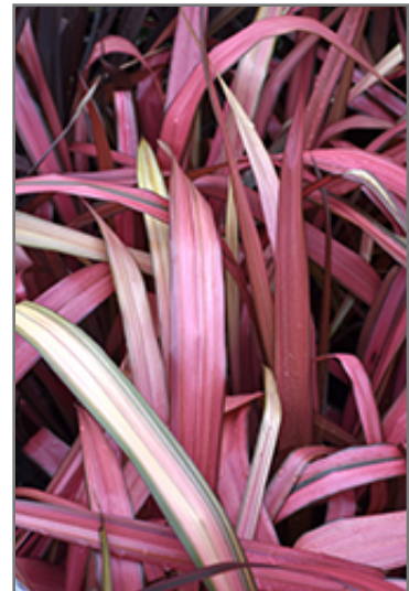
Margaret Jones New Zealand Flax foliage