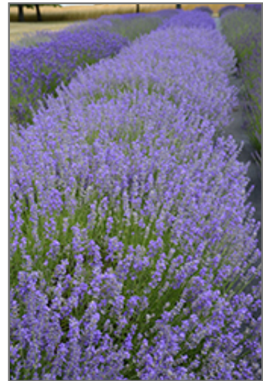
W.K. Doyle Lavender in bloom