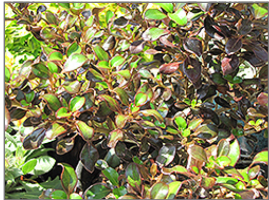
Karo Red Mirror Bush foliage