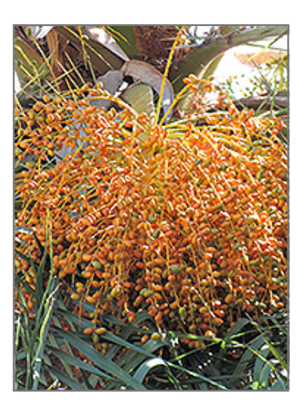
Senegal Date Palm fruit

Senegal Date Palm will grow to be about 50 feet tall at maturity, with a spread of 20 feet. It has a high canopy of foliage that sits well above the ground, and should not be planted underneath power lines. As it matures, the lower branches of this tree can be strategically removed to create a high enough canopy to support unobstructed human traffic underneath. It grows at a slow rate, and under ideal conditions can be expected to live for 60 years or more. This is a dioecious species, meaning that individual plants are either male or female. Only the females will produce fruit, and a male variety of the same species is required nearby as a pollinator.