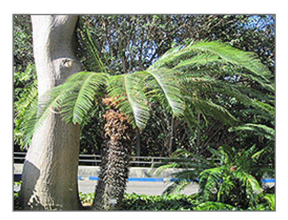
Taiwan Sago Palm