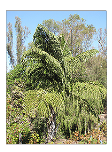
Toddy Fishtail Palm