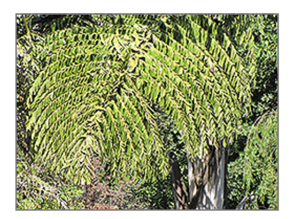
Toddy Fishtail Palm foliage

8546 Sun Valley Road Anytown, USA 12345 204.782.4147