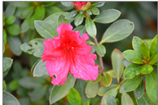
Nuccio's Carnival Time Azalea flowers