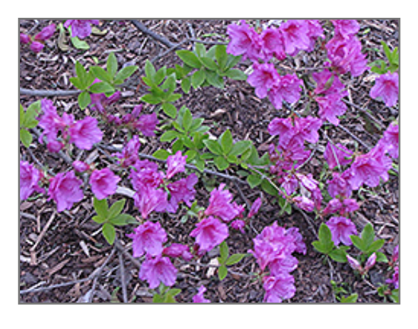
Jessica Azalea in bloom

Jessica Azalea is recommended for the following landscape applications;