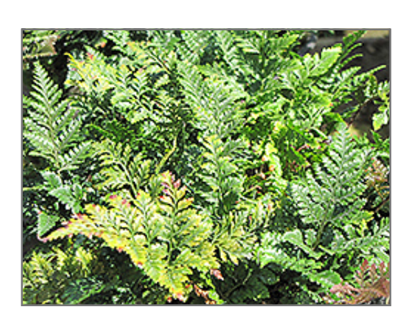
Squirrel's Foot Fern

When grown indoors, Squirrel's Foot Fern can be expected to grow to be about 18 inches tall at maturity, with a spread of 3 feet. It grows at a fast rate, and under ideal conditions can be expected to live for approximately 10 years. This houseplant performs well in both bright or indirect sunlight and strong artificial light, and can therefore be situated in almost any well-lit room or location. It does best in average to evenly moist soil, but will not tolerate standing water. The surface of the soil shouldn't be allowed to dry out completely, and so you should expect to water this plant once and possibly even twice each week. Be aware that your particular watering schedule may vary depending on its location in the room, the pot size, plant size and other conditions; if in doubt, ask one of our experts in the store for advice. It is not particular as to soil pH, but grows best in rich soil. Contact the store for specific recommendations on pre-mixed potting soil for this plant.