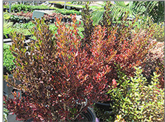
Pacific Sunset Mirror Bush