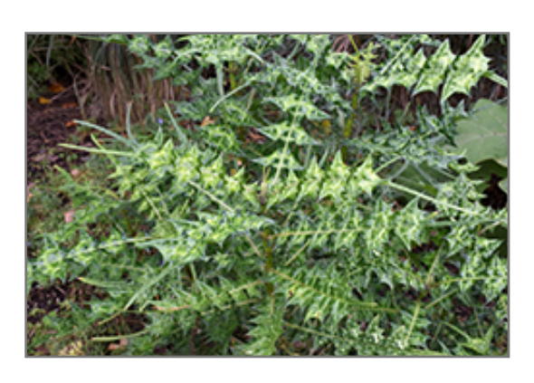
Mountain Thistle foliage