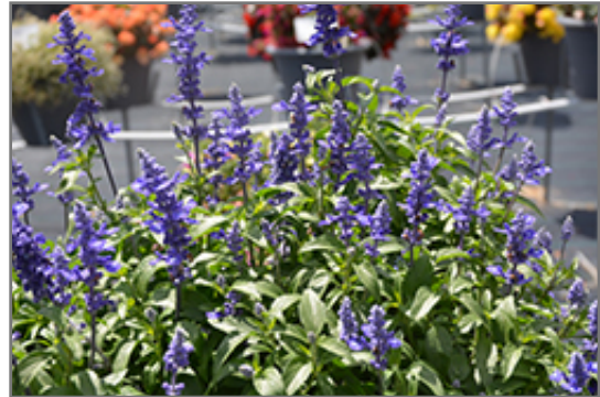
Icon Dark Blue Salvia in bloom