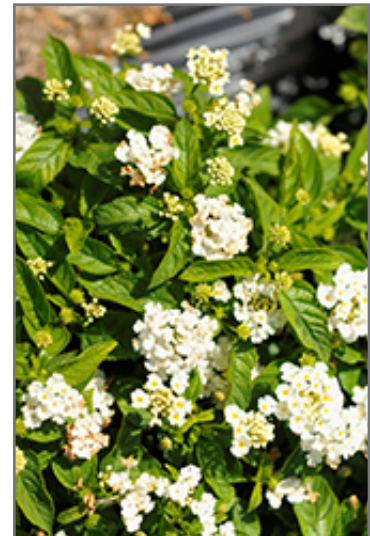
Gem Compact White Sapphire Lantana flowers

Gem Compact White Sapphire Lantana is recommended for the following landscape applications;