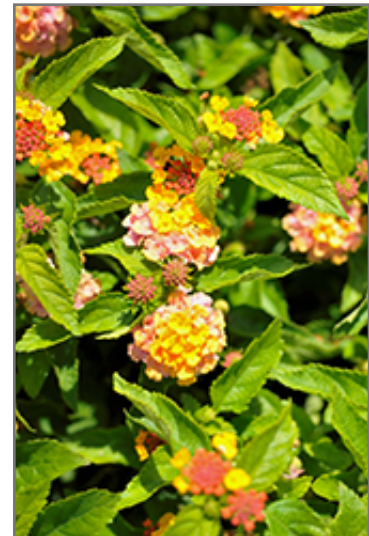
Gem Compact Rose Quartz Lantana flowers

Gem Compact Rose Quartz Lantana is recommended for the following landscape applications;