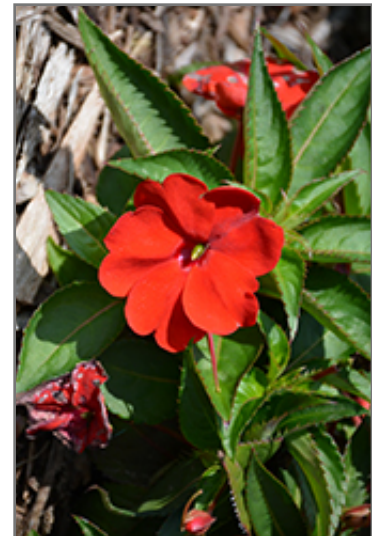
SunStanding Fire Red Impatiens flowers

SunStanding Fire Red Impatiens is recommended for the following landscape applications;