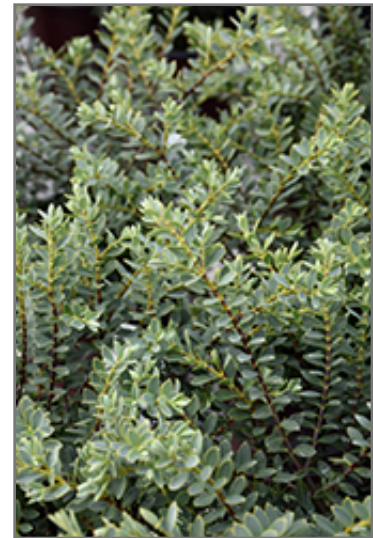
Western Hills Hebe foliage

Western Hills Hebe makes a fine choice for the outdoor landscape, but it is also well-suited for use in outdoor pots and containers. With its upright habit of growth, it is best suited for use as a 'thriller' in the 'spiller-thriller-filler' container combination; plant it near the center of the pot, surrounded by smaller plants and those that spill over the edges. It is even sizeable enough that it can be grown alone in a suitable container. Note that when grown in a container, it may not perform exactly as indicated on the tag - this is to be expected. Also note that when growing plants in outdoor containers and baskets, they may require more frequent waterings than they would in the yard or garden.