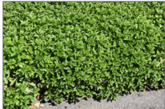
Selskian Stonecrop