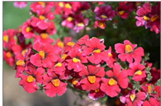
Nessie Plus Red Nemesia flowers