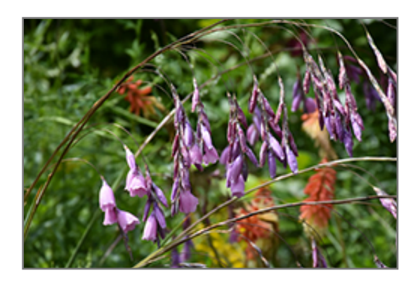
Angel's Fishing Rod flowers

Angel's Fishing Rod is recommended for the following landscape applications;