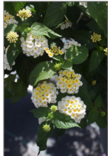
Landmark White Lantana flowers

Landmark White Lantana is recommended for the following landscape applications;