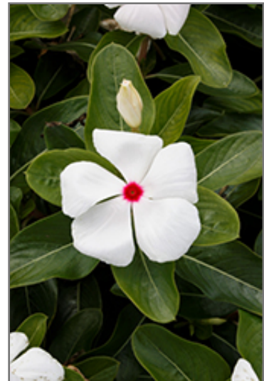
Cora Cascade Polka Dot Vinca flowers

Cora Cascade Polka Dot Vinca is recommended for the following landscape applications;