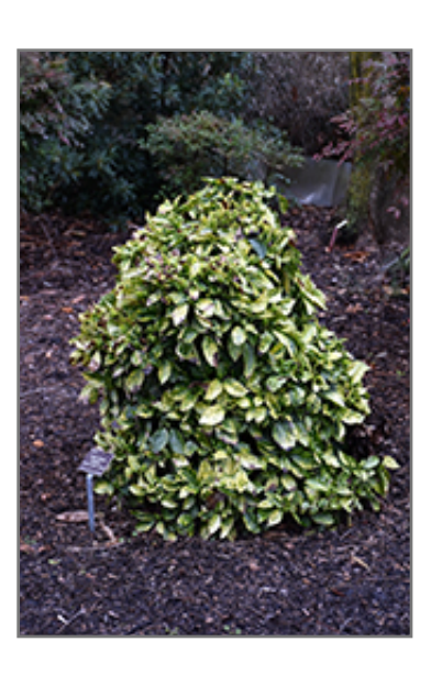
Goldilocks Aucuba

There are many factors that will affect the ultimate height, spread and overall performance of a plant when grown indoors; among them, the size of the pot it's growing in, the amount of light it receives, watering frequency, the pruning regimen and repotting schedule. Use the information described here as a guideline only; individual performance can and will vary. Please contact the store to speak with one of our experts if you are interested in further details concerning recommendations on pot size, watering, pruning, repotting, etc.