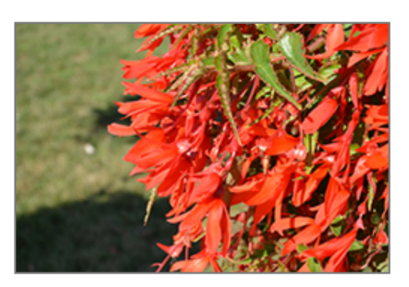
Bossa Nova Orange Begonia flowers

Bossa Nova Orange Begonia is recommended for the following landscape applications;