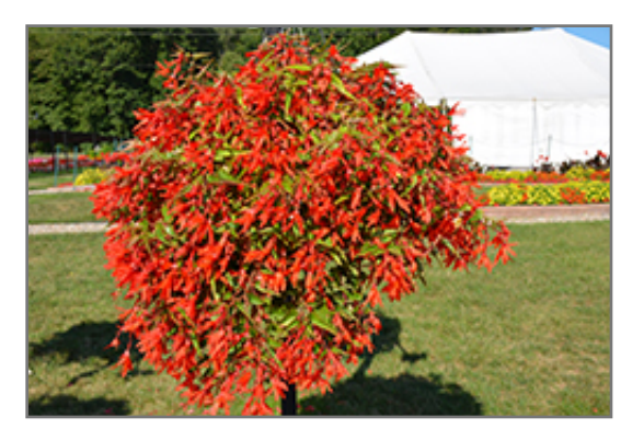
Bossa Nova Orange Begonia in bloom