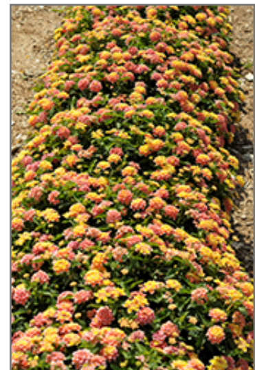
Lucky Peach Lantana in bloom