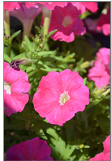
Picobella Pink Petunia flowers

Picobella Pink Petunia is recommended for the following landscape applications;