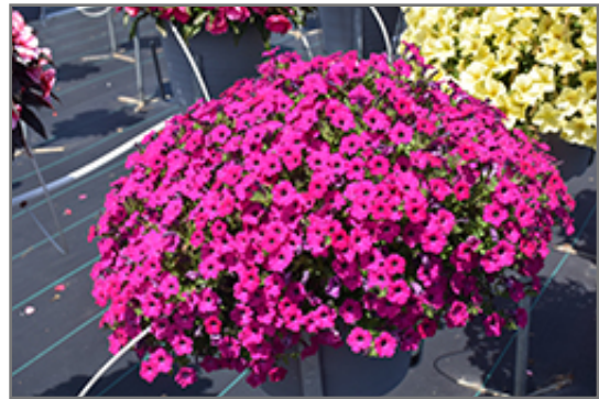
Itsy Magenta Petunia in bloom

Itsy Magenta Petunia is a fine choice for the garden, but it is also a good selection for planting in outdoor containers and hanging baskets. Because of its trailing habit of growth, it is ideally suited for use as a 'spiller' in the 'spiller-thriller-filler' container combination; plant it near the edges where it can spill gracefully over the pot. Note that when growing plants in outdoor containers and baskets, they may require more frequent waterings than they would in the yard or garden.