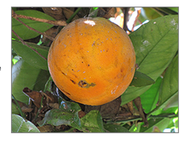
Fukumoto Navel Orange