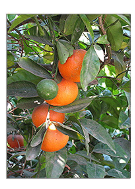
Honey Tangerine fruit

When grown indoors, Honey Tangerine can be expected to grow to be about 8 feet tall at maturity, with a spread of 6 feet. It grows at a medium rate, and under ideal conditions can be expected to live for approximately 50 years. This houseplant will do well in a location that gets either direct or indirect sunlight, although it will usually require a more brightly-lit environment than what artificial indoor lighting alone can provide. It prefers to grow in average to moist soil. The surface of the soil shouldn't be allowed to dry out completely, and so you should expect to water this plant once and possibly even twice each week. Be aware that your particular watering schedule may vary depending on its location in the room, the pot size, plant size and other conditions; if in doubt, ask one of our experts in the store for advice. It is not particular as to soil type or pH; an average potting soil should work just fine.