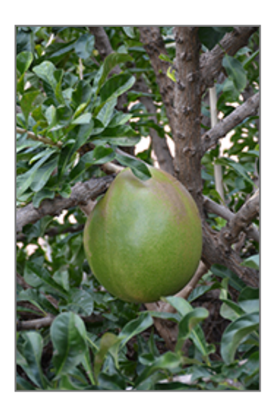
Pummelo fruit