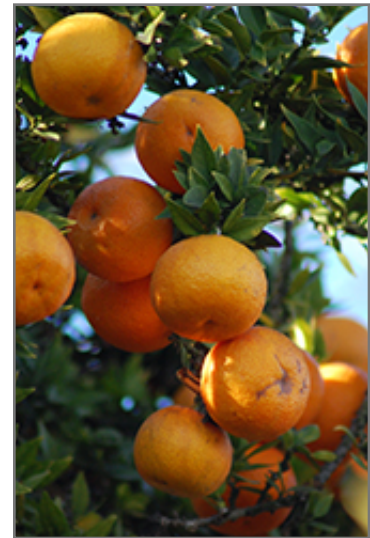
Chinotto Myrtle-leaved Orange fruit

This is a multi-stemmed evergreen houseplant with an upright spreading habit of growth. This plant may benefit from an occasional pruning to look its best.