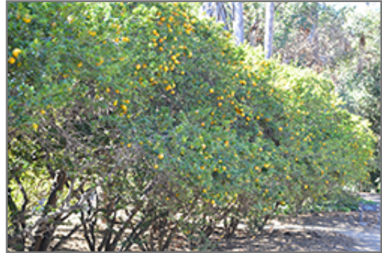
Chinotto Myrtle-leaved Orange

When grown indoors, Chinotto Myrtle-leaved Orange can be expected to grow to be about 10 feet tall at maturity, with a spread of 10 feet. It grows at a medium rate, and under ideal conditions can be expected to live for approximately 50 years. This houseplant requires direct sun for optimal performance, and should therefore be situated in a room that gets bright sunlight for a good part of the day; it is not a good choice for rooms lit only by artificial light. It prefers to grow in average to moist soil. The surface of the soil shouldn't be allowed to dry out completely, and so you should expect to water this plant once and possibly even twice each week. Be aware that your particular watering schedule may vary depending on its location in the room, the pot size, plant size and other conditions; if in doubt, ask one of our experts in the store for advice. It is not particular as to soil type or pH; an average potting soil should work just fine.