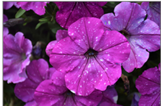
Constellation Aries Petunia flowers

This plant will require occasional maintenance and upkeep. Trim off the flower heads after they fade and die to encourage more blooms late into the season. It is a good choice for attracting hummingbirds to your yard, but is not particularly attractive to deer who tend to leave it alone in favor of tastier treats. It has no significant negative characteristics.