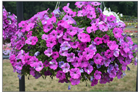
Constellation Aries Petunia in bloom

Constellation Aries Petunia is a fine choice for the garden, but it is also a good selection for planting in outdoor containers and hanging baskets. It is often used as a 'filler' in the 'spiller-thriller-filler' container combination, providing a mass of flowers against which the thriller plants stand out. Note that when growing plants in outdoor containers and baskets, they may require more frequent waterings than they would in the yard or garden.