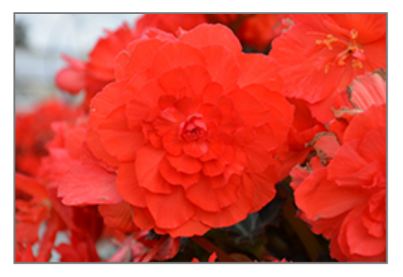
l'Conia Portofino Salmon Begonia flowers

l'Conia Portofino Salmon Begonia is recommended for the following landscape applications;