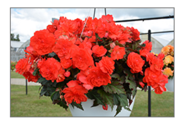
l'Conia Portofino Salmon Begonia in bloom