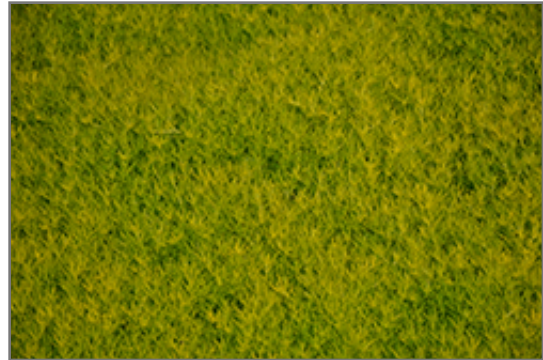
Scotch Moss foliage